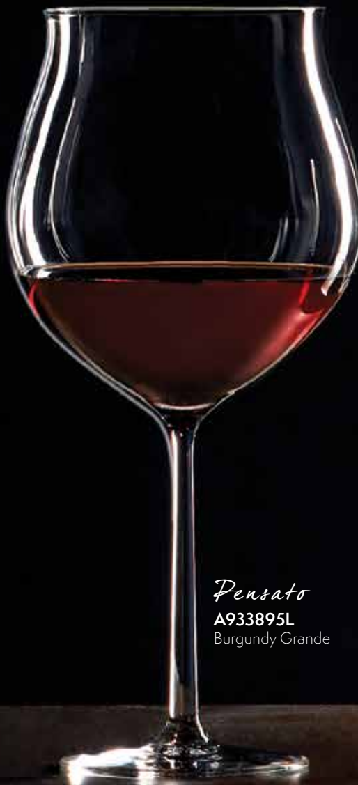
Pensato A933895L Burgundy Grande