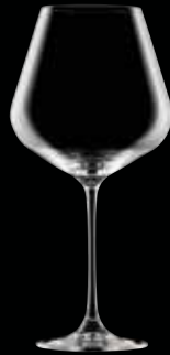
A934895 Burgundy 30 3/4 oz. H 9 7/8" | D 3 3/8" 2 doz.