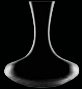
A931059 Decanter 25 ¼ oz. H 8 ⅝" | D 8 ½" ½ doz.