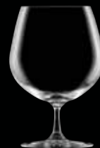
A933018 Cognac 22 oz. H 6 ⅞" | D 3 ¼" 2 doz.