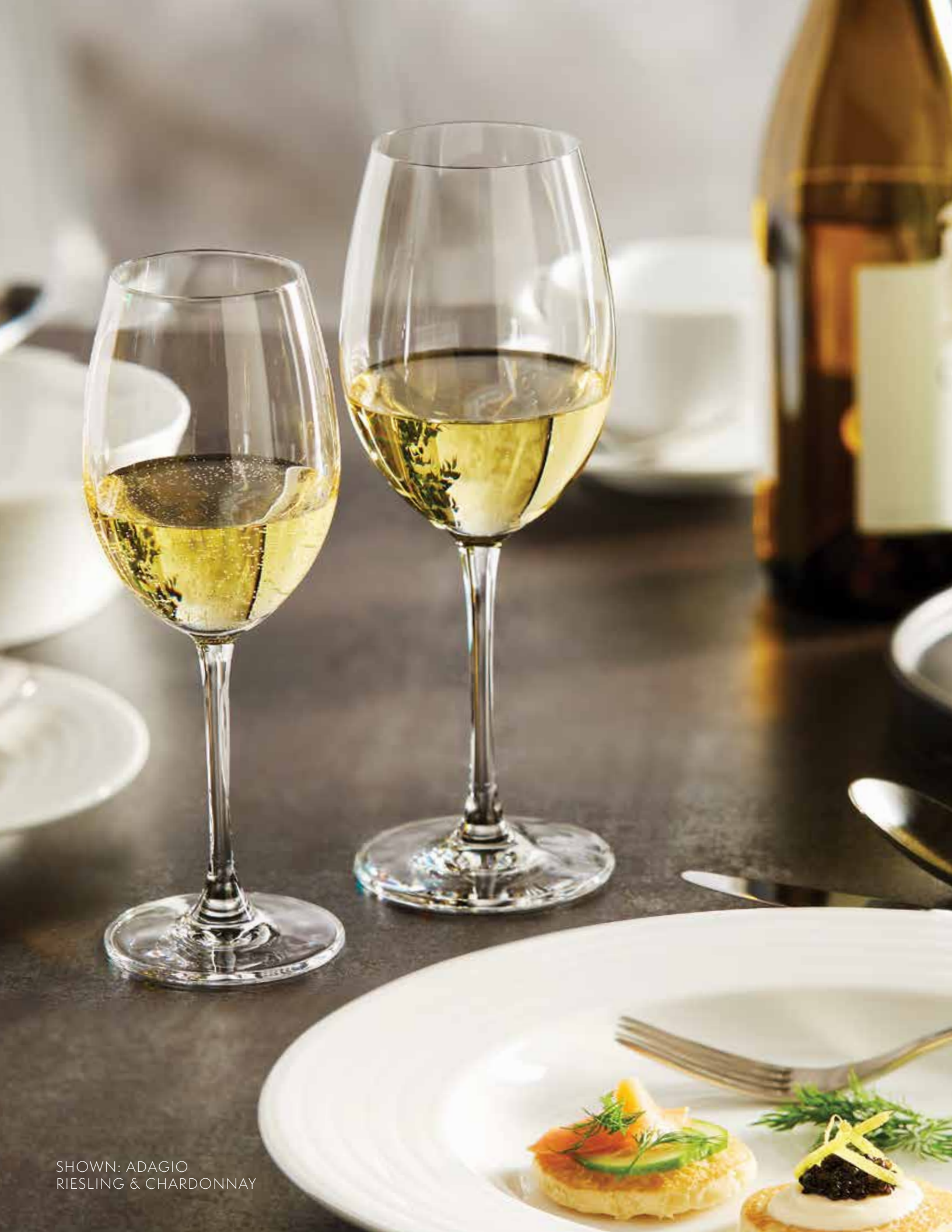
SHOWN: ADAGIO RIESLING & CHARDONNAY