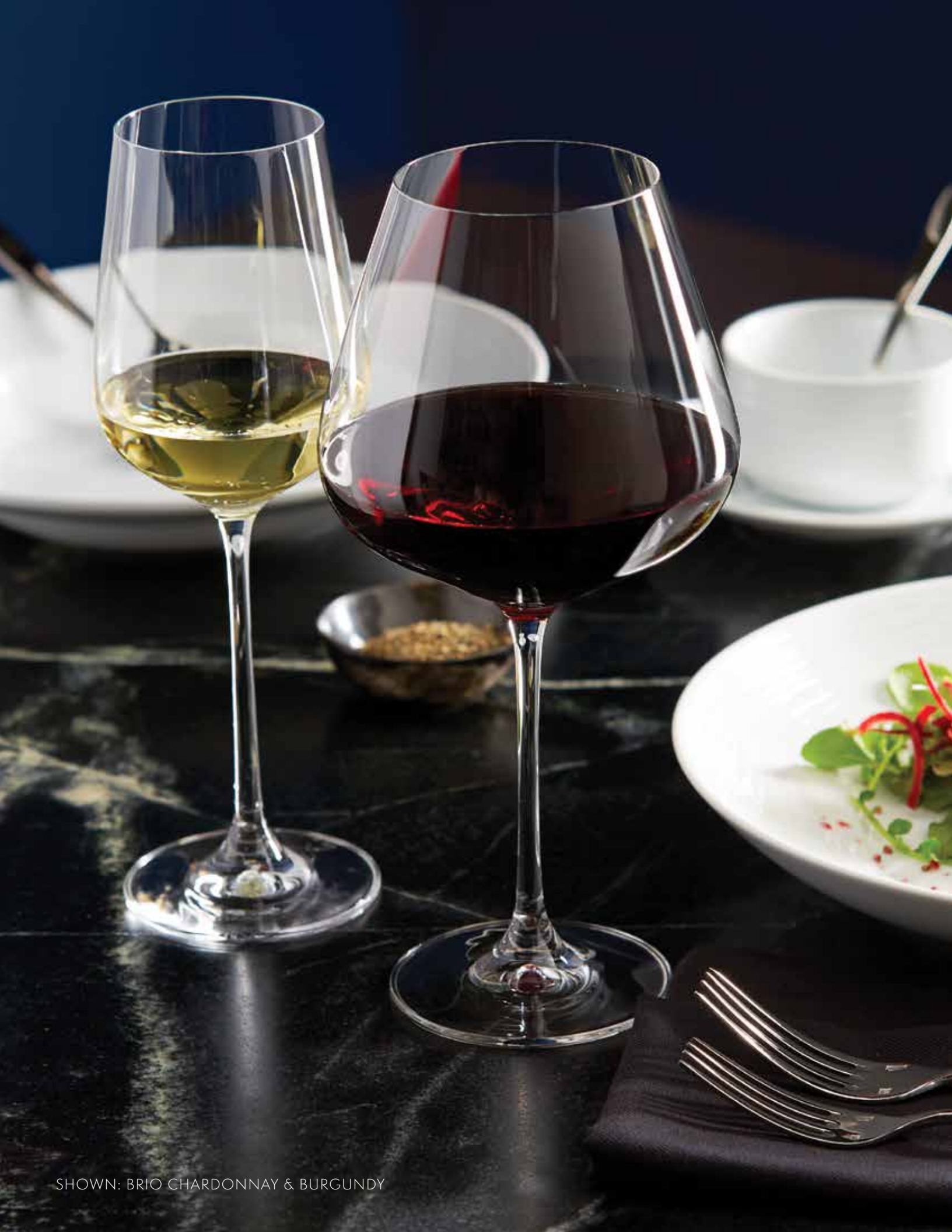
SHOWN: BRIO CHARDONNAY & BURGUNDY