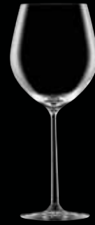
A933895 Burgundy 22 ½ oz. H 9 3/4" | D 3 1/4" 2 doz