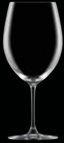
A931183 Bordeaux 25 ¼ oz. H 8 7/8" | D 3 3/8" 2 doz.

Relax and indulge. Adagio is a fusion of time-honored classic design and easygoing elegance. Imagine a laid-back guest experience where the wine can be the star. Each shape in the range is intended for relaxed gatherings and chic casual dining where a sense of style is essential.