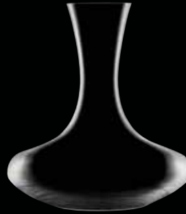
A931059L Decanter 33 ¾ oz. H 9 ½" | D 9 ¼" ½ doz.