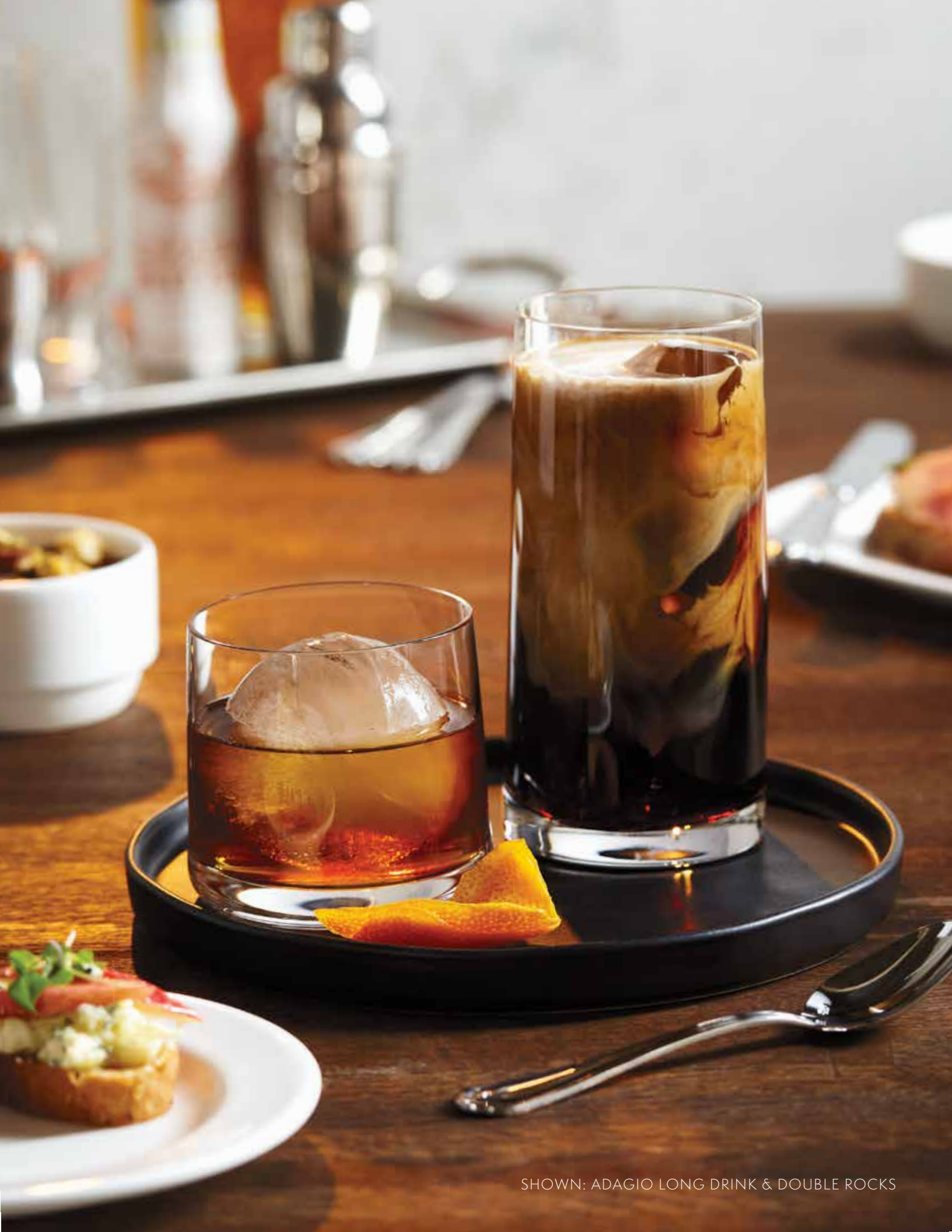
SHOWN: ADAGIO LONG DRINK & DOUBLE ROCKS