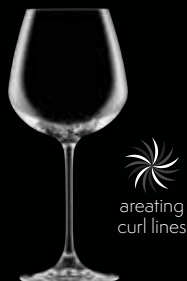
A935090A All Purpose 14 ¼ oz. H 8 5/8" | D 3 ½" 2 doz.