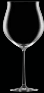
A933895L Burgundy Grande 33 oz. H 9 7/8" | D 3 5/8" 2 doz.