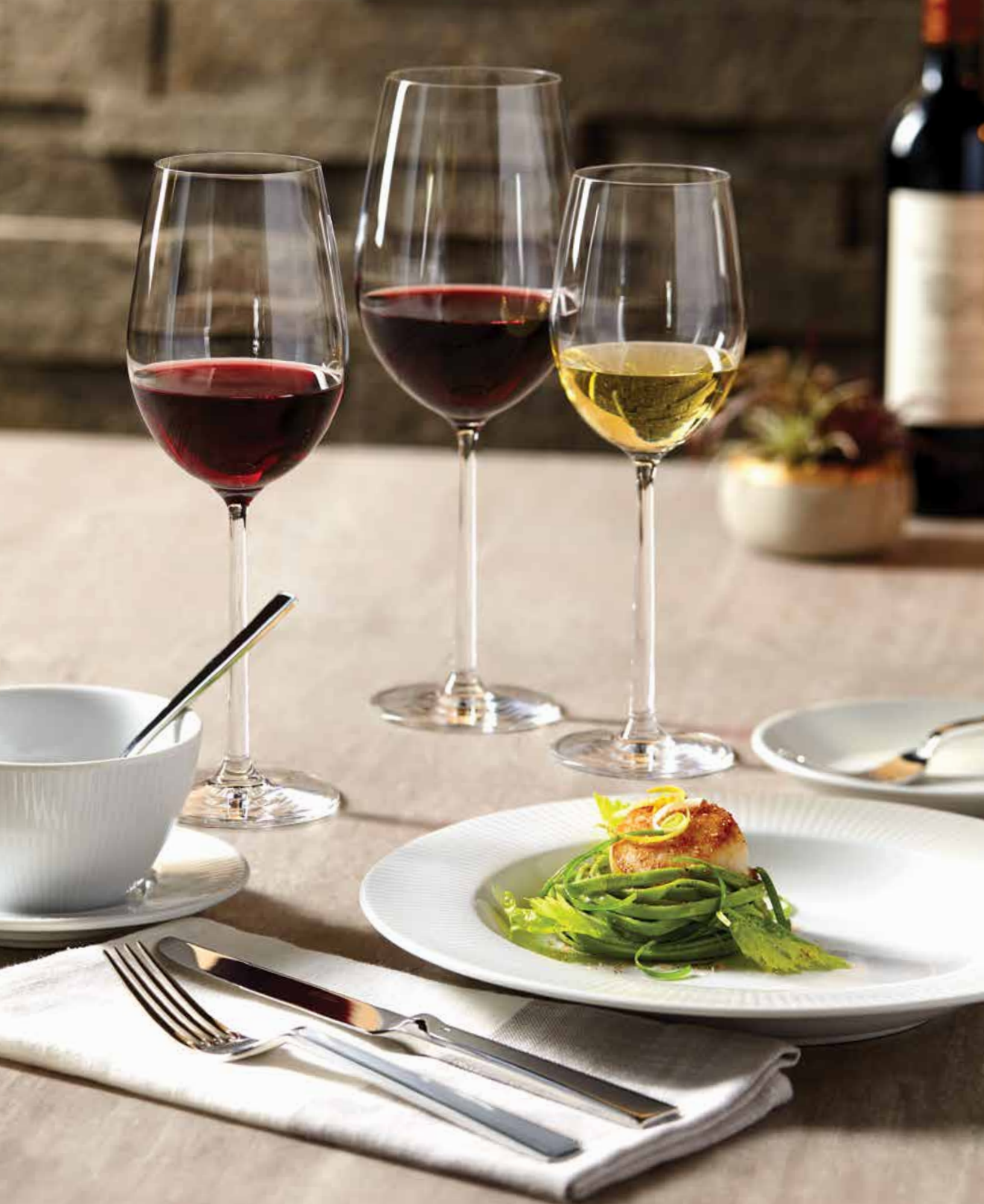
SHOWN: PENSATO BEAUJOLAIS, BORDEAUX & CHARDONNAY