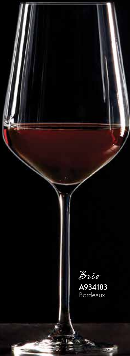
Brío A934183 Bordeaux