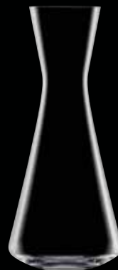
A932081L Carafe 33 ¾ oz. H 11 ½" | D 5" ½ doz.