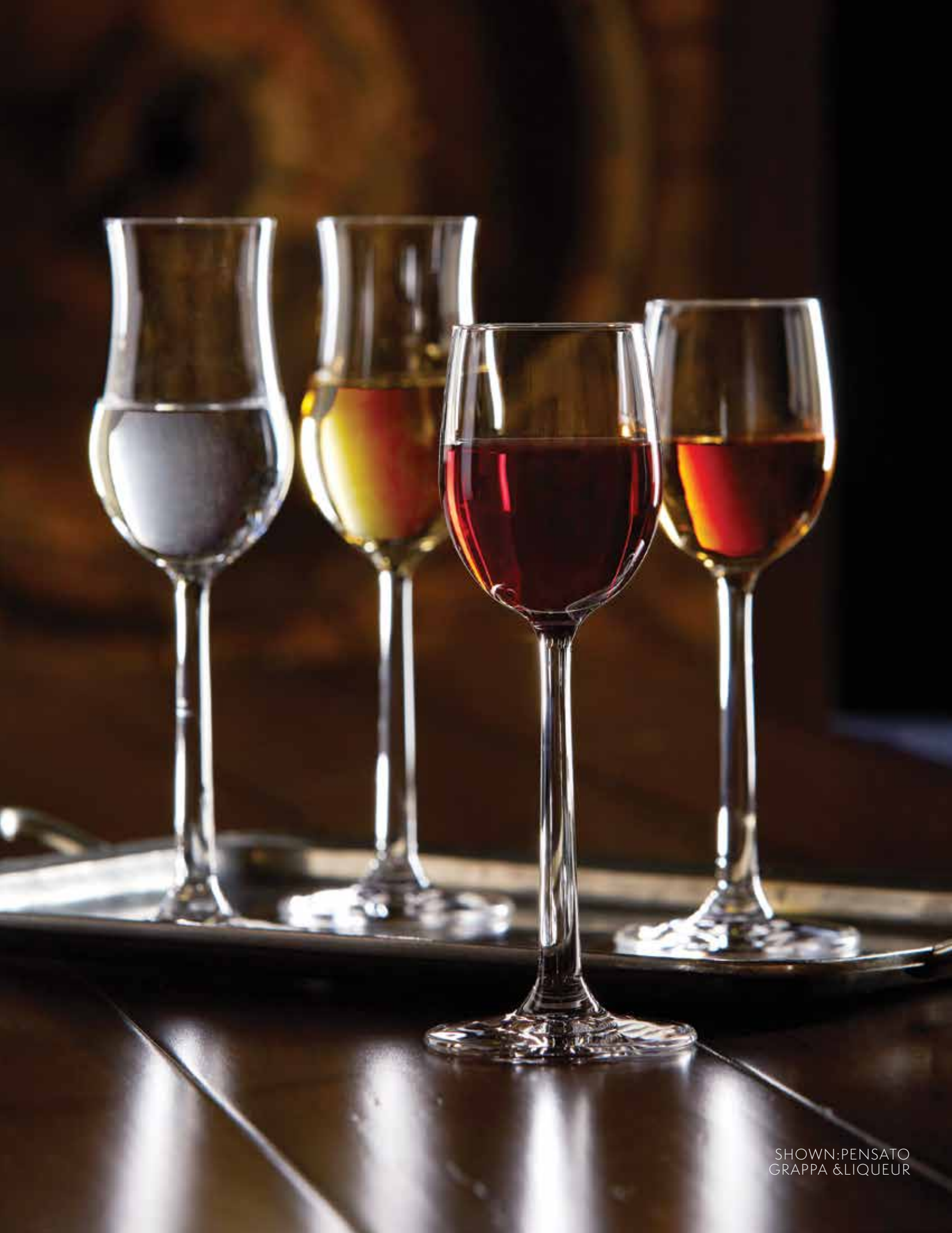
SHOWN: PENSATO GRAPPA & LIQUEUR