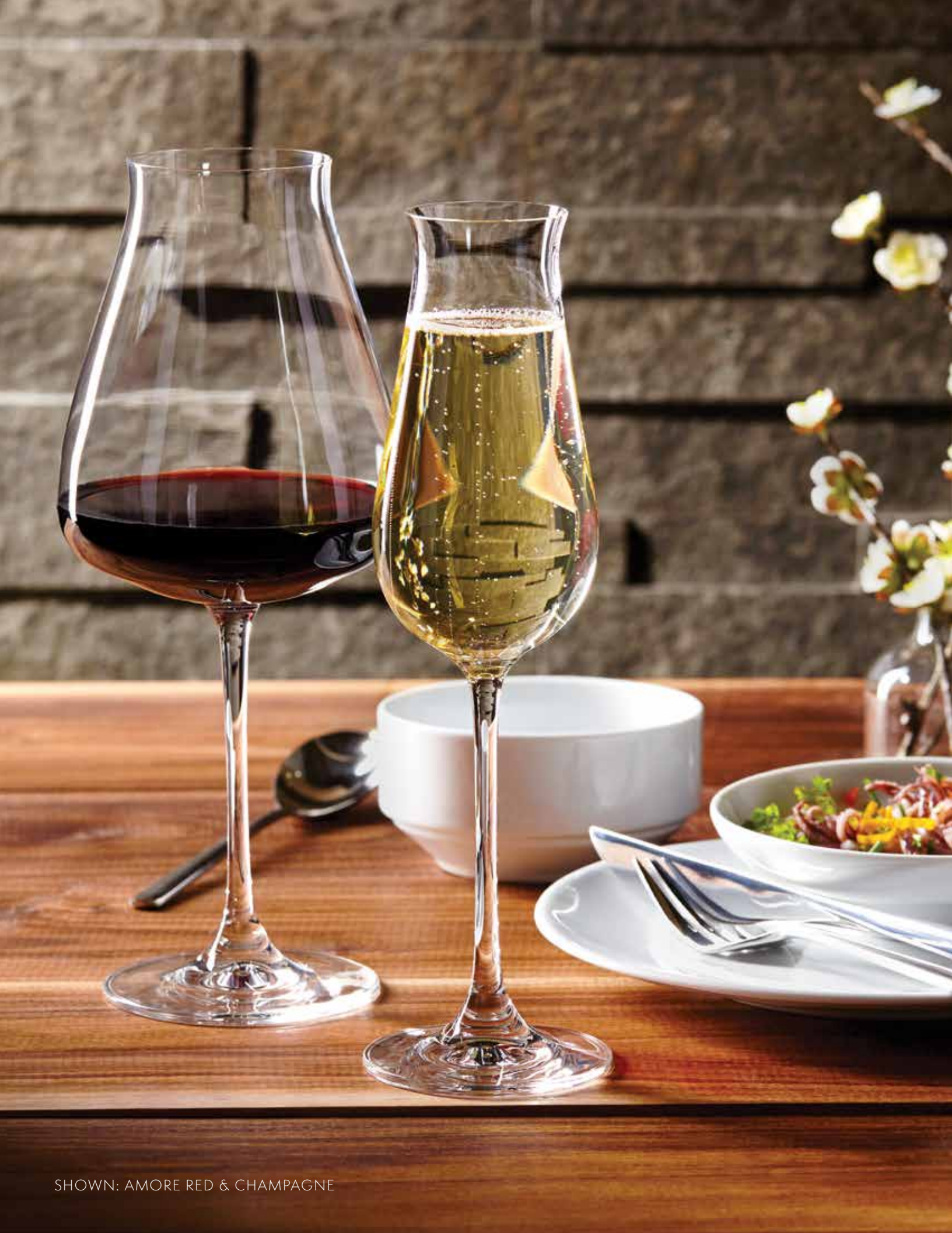
SHOWN: AMORE RED & CHAMPAGNE