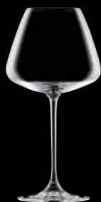
A935083 Red 20 oz. H 8 5/8" | D 4 3/8" 2 doz.