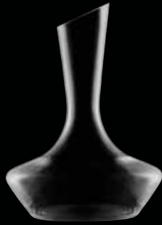
A932059 Decanter 25 ¼ oz. H 9 ⅞" | D 7 ⅜" ½ doz.