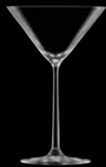
A933503 Martini 7 ¾ oz. H 7 ½" | D 4 ¾" 2 doz.