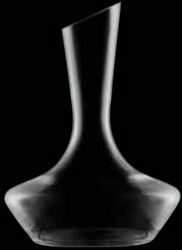
A932059L Decanter 33 ¾ oz. H 10 ⅞" | D 8 ¼" ½ doz.

Our selection of decanters and carafes will elevate and complete your wine or drink service. Enhance the flavors and aroma of your wine with our decanters, or elegantly serve or infuse waters, juices or teas with our carafes. These timeless designs work beautifully with a variety of tabletop aesthetics.