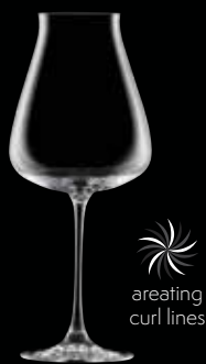
A935083A Red 23 ¾ oz. H 10" | D 4 1/8" 2 doz.

Lofty and artful, created for wine connoisseurs by wine sommeliers. The unique aerating design brings micro-oxidation technology to the glass, revealing complex flavor compounds in fine wine. Amore's shape is designed to reveal hidden flavors from even the most mature complex wines. Each bowl shape and style has been developed to offer an unprecedented flavor experience.