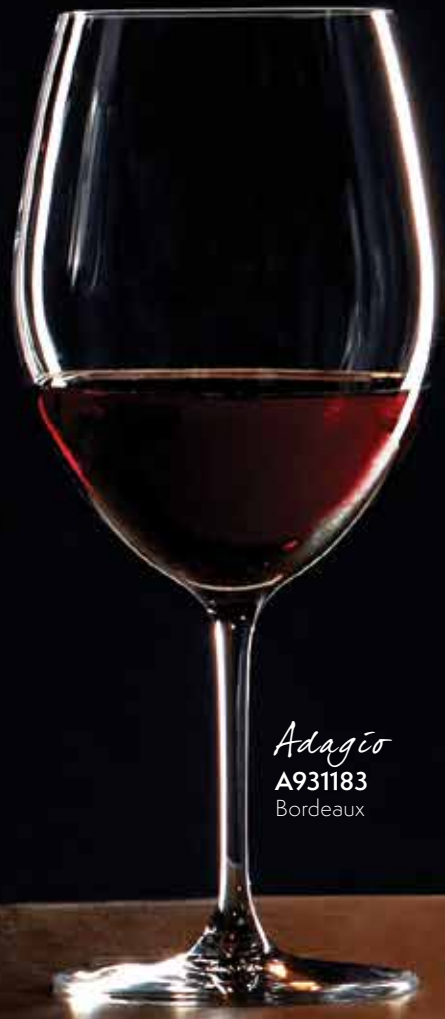
Adagio A931183 Bordeaux