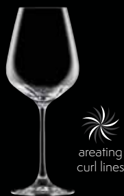
A935084A White 16 ½ oz. H 8 ½" | D 3 ¾" 2 doz.