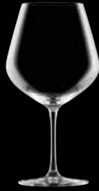
A932895 Burgundy 25 oz. H 8 3/8" | D 3 3/8" 2 doz.