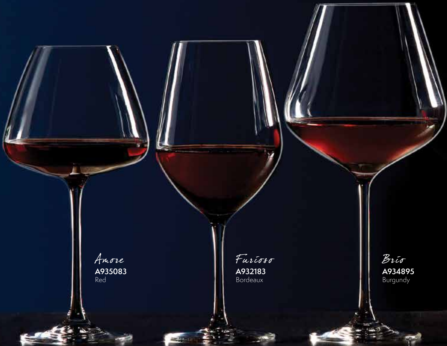
Amore A935083 Red

Sant'Andrea Crystal joins our established flatware and dinnerware ranges to offer a complete luxury statement in design-driven culinary tableware. With guests, chefs and operators in mind, Oneida is always designing the dining experience.