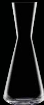
A932081 Carafe 25 ¼ oz. H 10 ½" | D 4 ½" ½ doz.