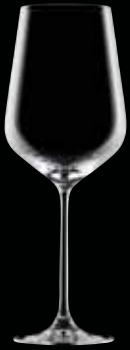
A934183 Bordeaux 26 oz. H 10 7/8" | D 3 3/8" 2 doz.

Dynamic and animated, Brio is charged with energy and spirit. This shape projects a wine's highest aspirations with the natural elegance it deserves. The visually articulate geometry of the bowl allows wine to breathe and speak to the guest. Generous surface area in the bowls and tall elegant stems convey a luxurious first impression. This shape is ideal for upscale wine lists and dynamic environments.