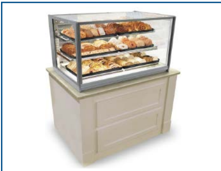
Model ITD4826 Counter not provided