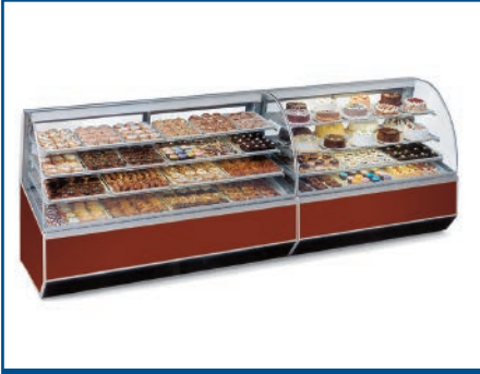
Model SNR59SC / SNR48SC