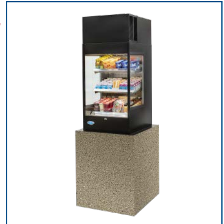
TSSM2454 Specialty Merchandiser Contact Factory for more information.