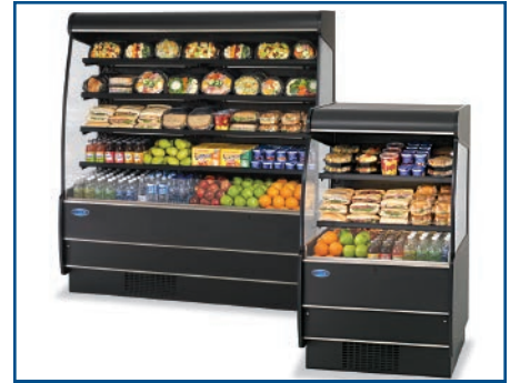
Model RSSM678SC / RSSM360SC