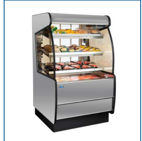
HSSM Heated Merchandiser