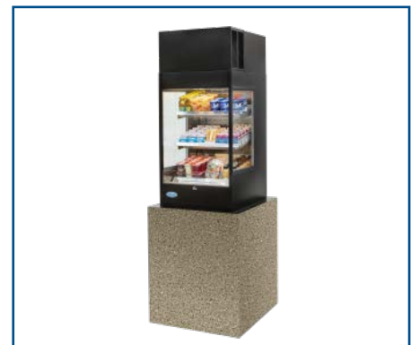
TSSM2454 Specialty Merchandiser See page 14 for more information.