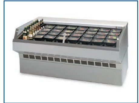
Model SQ8CDSS (Shown with panel base)