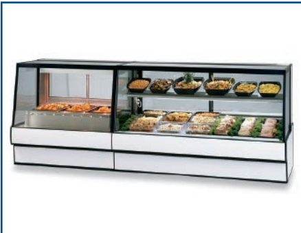
Model SG5048HD / Model SGR7748CD