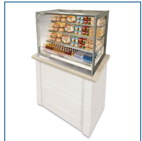
Model ITRSS4834 Counter not provided