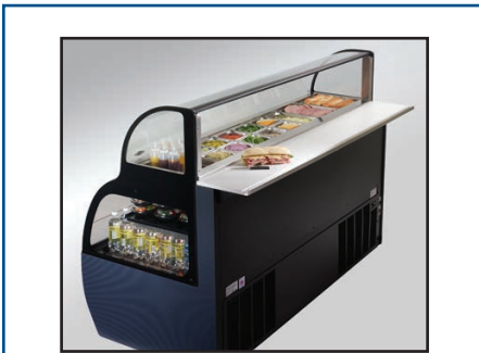
Model SSRSP-5952 LED lighting lower section only