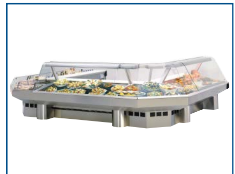
*Shown with optional closed pedestal base