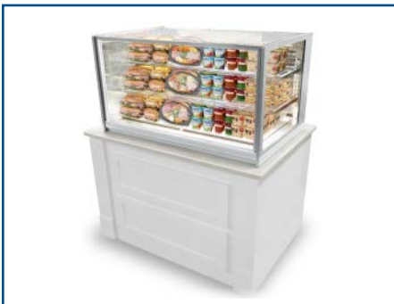
Model ITD4834-B18 Counter not provided