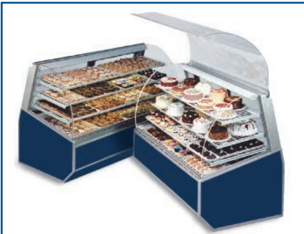
Model SN77 Lift-up front glass