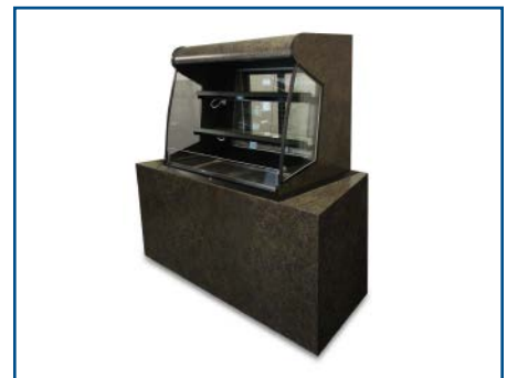
Model RSSM Drop In Option Contact Factory for more information.