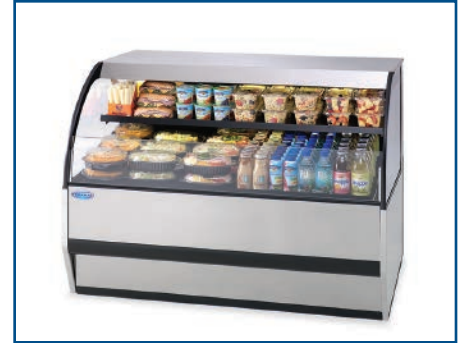
Model SSRVS5933 Shown with optional shelf