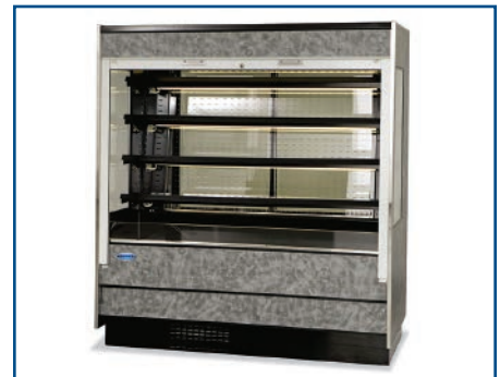
Model RSSM678SC with security roll-up cover requires squared ends. Shown with optional rear sliding doors.