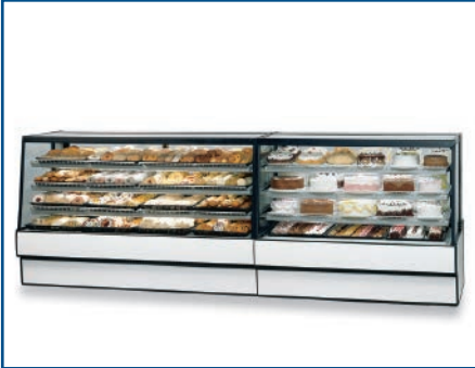
Model SGD7748 / Model SGR5948