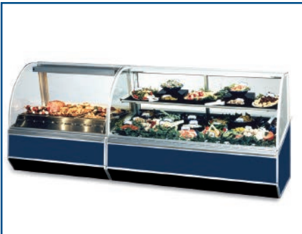
Model SN4HD/ Model SN6CD