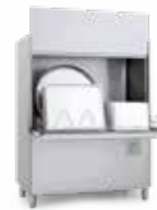
787 SHIP WT: 770 lbs LIST PRICE: $25,440