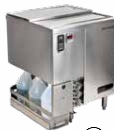
XG-37 SHIP WT: 175 lbs LIST PRICE: $7,130