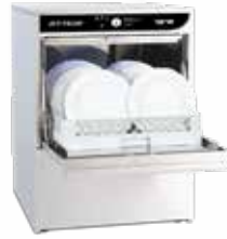
737E SHIP WT: 178 lbs LIST PRICE: $5,930