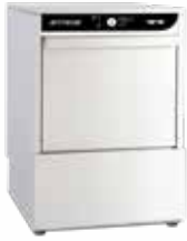
727E SHIP WT: 116 lbs LIST PRICE: $4,300