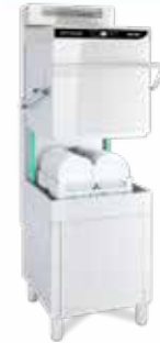
757EV SHIP WT: 370 lbs LIST PRICE: $15,440