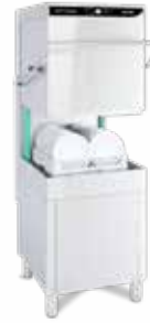
757E SHIP WT: 340 lbs LIST PRICE: $8,780