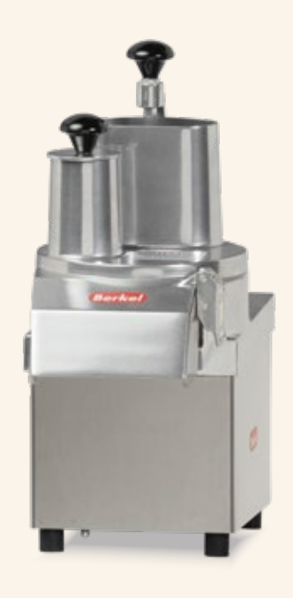
Model M2000 Additional Models Available