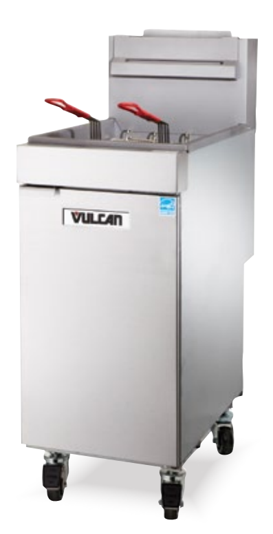
Model 1VEG35M Shown with accessory casters