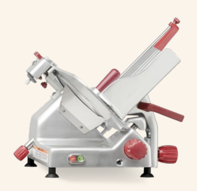
Model 827A-PLUS Additional Models Available