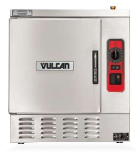
Model C24EA5 PLUS