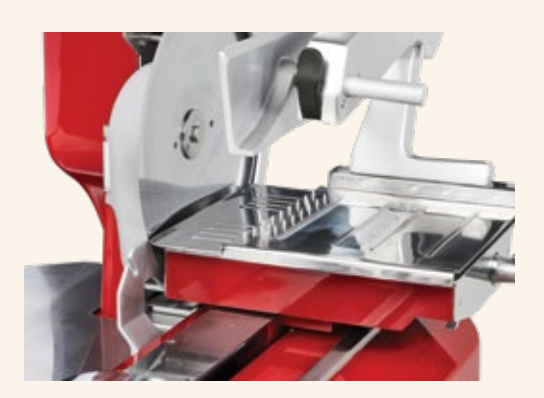
Model 330M - Carriage Tray detail