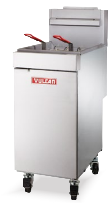
Model LG300 Shown with accessory casters