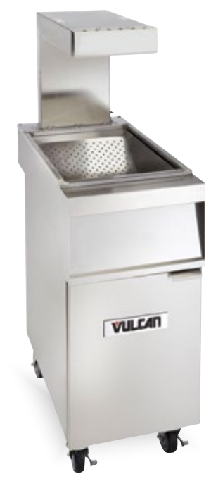
Model VX15 Shown with optional ThermoGlo™ Food Warmer