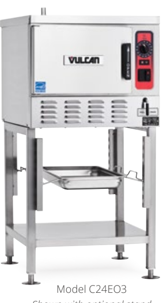
Shown with optional stand