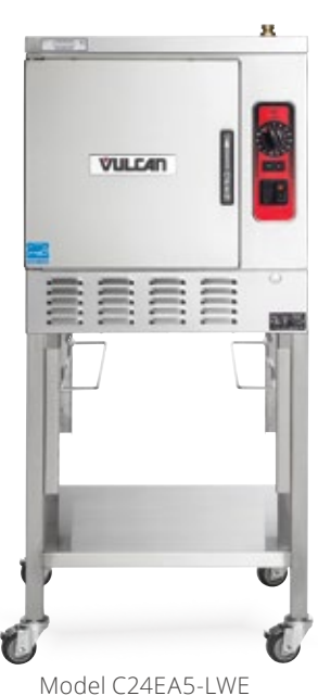
Model C24EA5-LWE Shown with optional stand