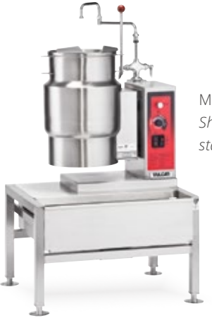
Model K6ETT Shown with optional stand and faucet